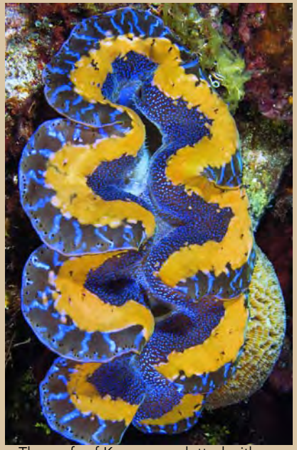
The reefs of Kosrae are dotted with incredible clams of amazing vibrancy

Entry and Exit Requirements: No visa is required for entry into the Federated States of Micronesia for visitors traveling on Australian passports. A US$15 departure tax is collected at the airport as you leave the island. Electricity: 110vAC, 60hz, US outlets (two vertical pins with round earth pin below). Make sure you bring chargers capable of 110volts and US adapters.